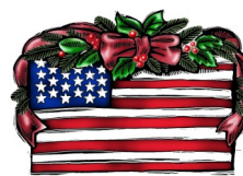
Remember Those in the Military